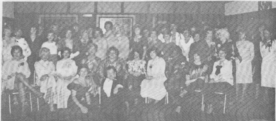
Chi Chapter Awards Banquet

At the time of this particular printing of our brochure, we are developing an auxiliary organization for crossdressers and their wives and woman-friends. The purpose of this organization is to enhance the crossdressing lives of both parties through regional gatherings which will be held at resort hotels and which will be a two-day event. Most of the time will be social, but our intentions are also to have guest speakers who are quite knowledgeable and proven authorities concerning crossdressing. It is believed that our wives and woman-friends will benefit from association with many other wives and woman-friends and will find the going a bit easier when dealing with crossdressing. And, of course, there is the belief that many marriages can be made more secure and happier through this Couples