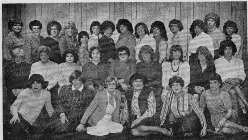
Chi - Delta - Mu

WHAT IS IT? WHOM IS IT FOR? WHAT ARE ITS GOALS?